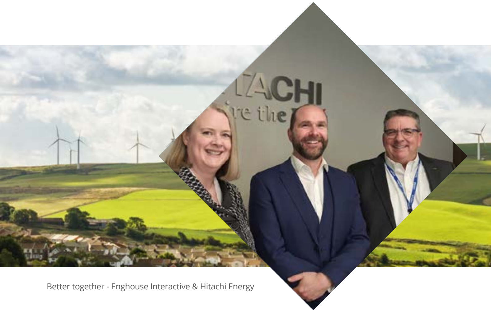
Better together - Enhouse Interactive & Hitachi Energy

agents can focus on delighting customers rather than having to switch between systems or search for answers.