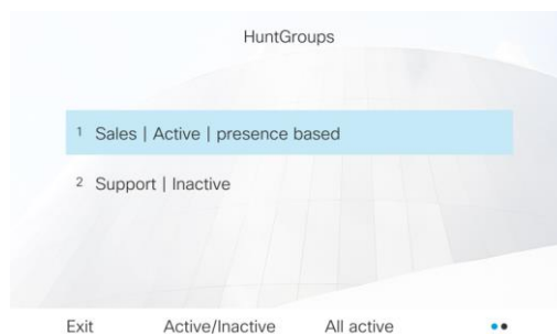
Display current Hunt Groups and status therein

Each user may log on to or off from one Hunt Group or all at once. This can be done on the Cisco phone as well as in Jabber.